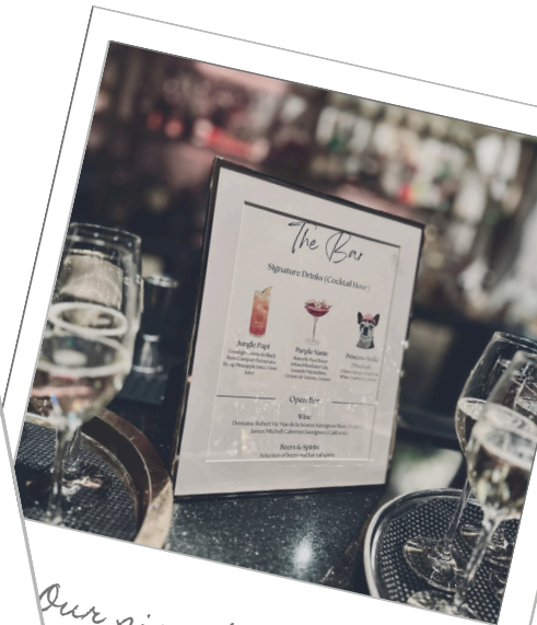
Our signature cocktail