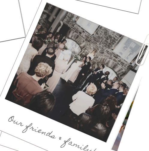
Our friends & family!

JUST PICTURE TALL THE MEMORABLE MOMENTS THAT ARE GOING TO TAKE PLACE