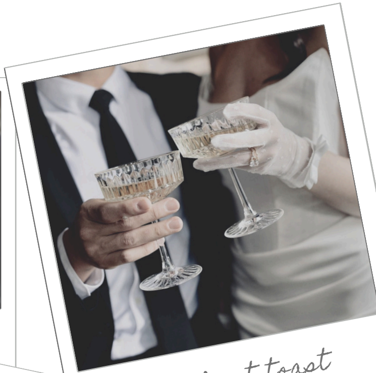
Our first toast