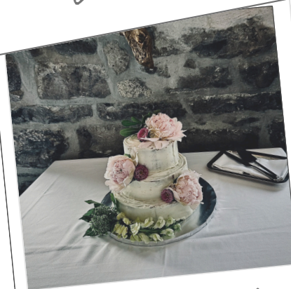
Our wedding cake