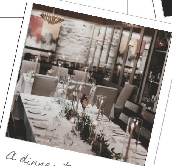
A dinner to remember